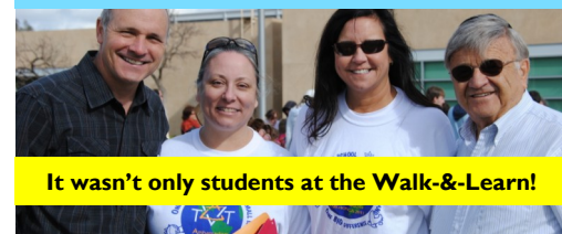
It wasn't only students at the Walk-&-Learn!