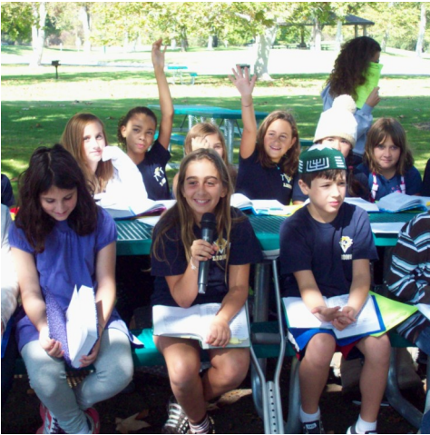
A New Year 's Ceremony

As part of the traditions accompanying Rosh Hashanah, our 4 th and 5 th grade students experienced Tashlikh at Mason Park. Thank you to our parents who carpoled and chaperoned this event! Look online for a complete slideshow!