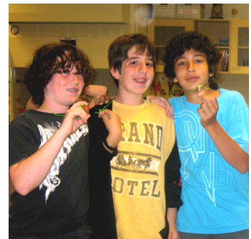
Middle School Studies Cell Bio

Our first graders participated in a seasonal honey workshop, which included a focus on bee behavior. More photos can be found online.